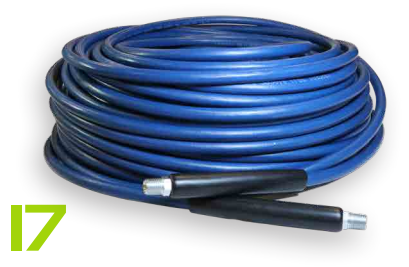
Carpet Solution Hose CARPET CLEAN 1/4" 3000PSI (250°) (1-WIRE BRAID)