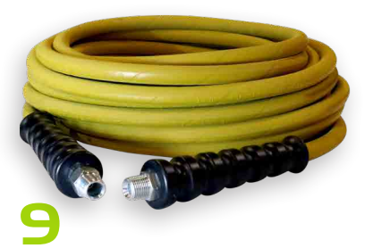
Pressure Washer Hose (cold-water) COMMERCIAL CLEAN 3/8" 4000PSI (250°F) (1-WIRE BRAID)