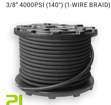
Sewer & Jetter Hose BULK HOSE