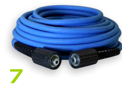
Pressure Washer Hose CONSUMER UBERFLEX<sup>™</sup> 1/4" 3100PSI (140°F) (TEXTILE BRAID)