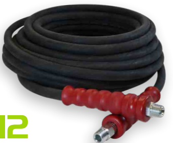
Pressure Washer Hose (hot-water) ARM-A-FL€X™ 3/8" 4785PSI (250°) (2-WIRE BRAID)

Pressure Washer Hose CONSUMER CLEAN 1/4" 3000PSI (140°F) (TEXTILE BRAID)