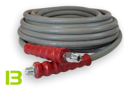
Pressure Washer Hose (hot-water) COMMERCIAL HOT CLEAN 3/8" 6000PSI (250°) (2-WIRE BRAID)